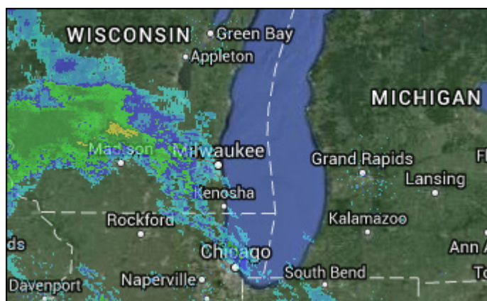
A weather radar WMS layer shows a storm near Lake Michigan.

MARPLOT has a variety of different basemaps that you can use as the background image for your map, including both satellite and street view maps with global coverage. The basemaps are provided by online services, so that they are showing the latest information. Additionally, MARPLOT also offers the ability to download basemap tiles for offline use.