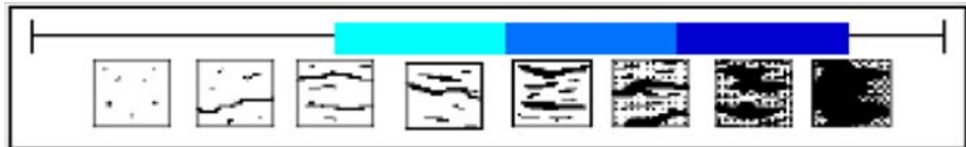
this scale bar shows the meaning of the distribution terms at the current time